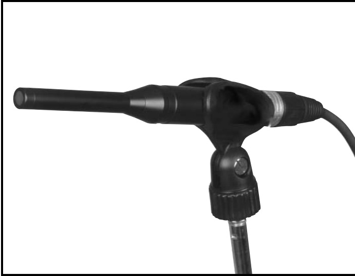
*Microphone clip may not appear exactly as shown