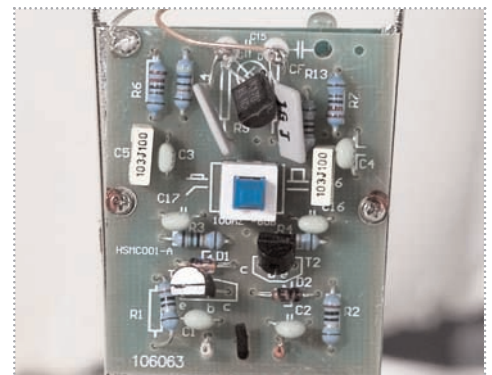
Internal Low Frequency Roll-off Switch